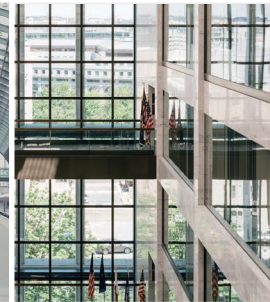
GOVERNMENT & CORPORATE