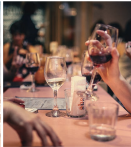
FOOD & BEVERAGE SERVICE