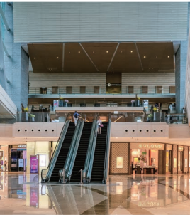
RETAIL & HOSPITALITY