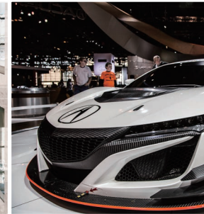
EVENTS & ENTERTAINMENT